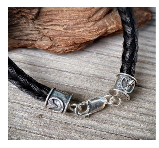
Standard round ends