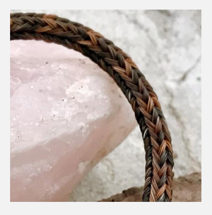
CHEVRON ROUND BRAID (16 sections)