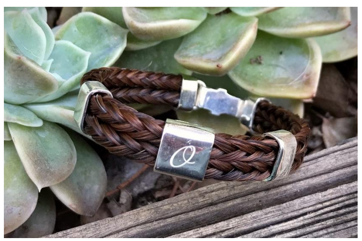
THE GREY: ORIGINAL

The prices include engraving of a single initial on the central connector piece, or in the case of The Grey: Divided, on each of the 2 square beads. Additional engraving may be subject to an extra charge.