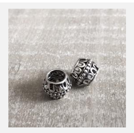
FILIGREE BEAD R90 ea.