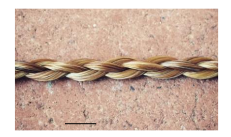
ROUND BRAID (4 sections)

Simple, beautiful and tough. Perfect for occasional to medium wear.