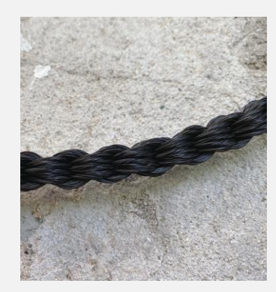
CHAIN BRAID (16 sections)