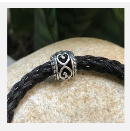
HEART BEAD R150 ea.