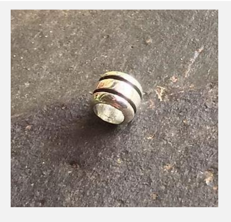
ROUND BEAD WITH STRIPES R110 ea.