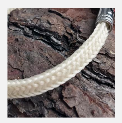
FLAT BRAID (16 sections)